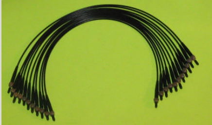
Extension fiber patch- cords